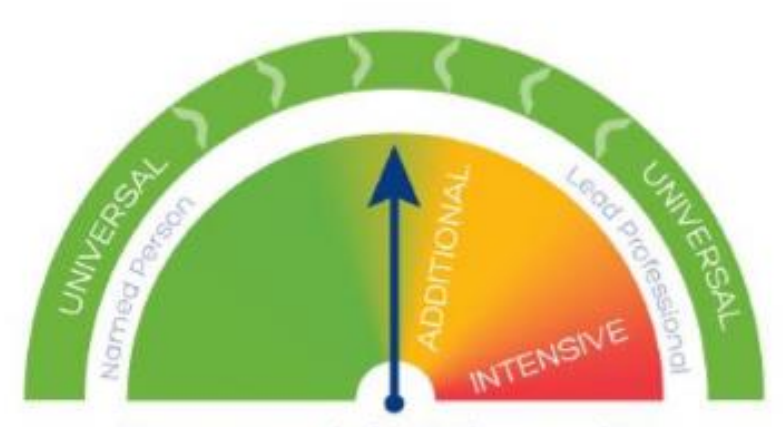
Framework for Intervention